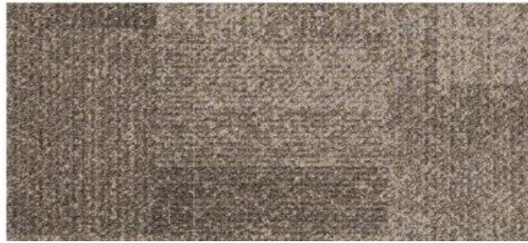
Chestnut - RAN39-94