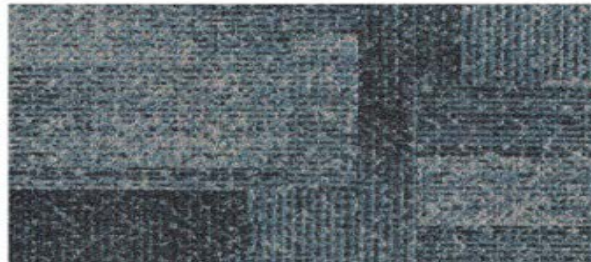
Jay - RAN119-126