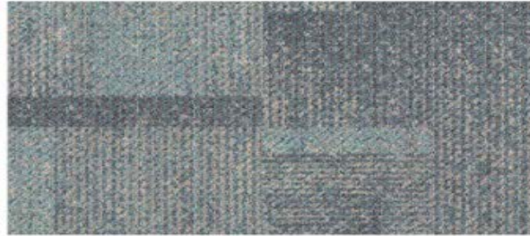
Blue Lotus - RAN140-132