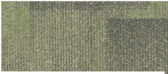
Spearmint - RAN174-141