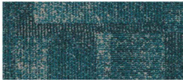
Sea Green - RAN119-201