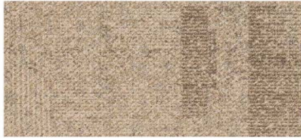
Gypsum - RAN94-15