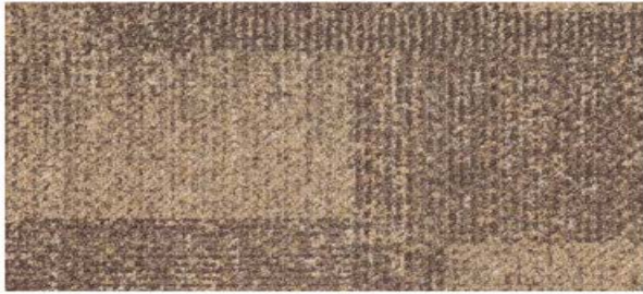
Olive Slate - RAN83-40