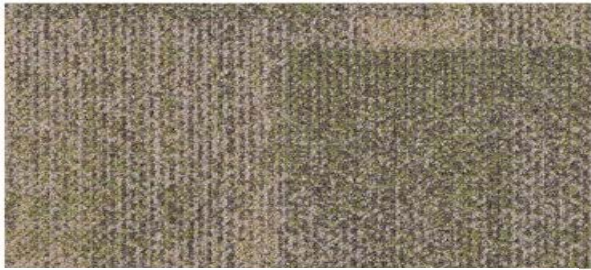
Surrey - RAN62-40