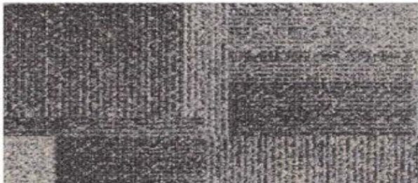
Galenite - RAN218-119