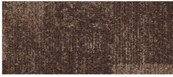
Woodland - RAN69-114