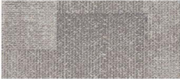
New Stone - RAN218-153